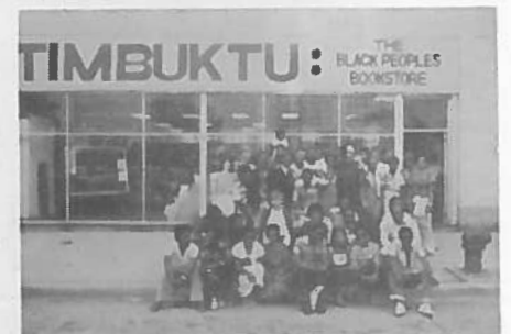
Delegation of English Teachers from French Speaking Africa after I.C.B.S. Reception

BOOKSTORE CATALOGUE. Timbuktu: The Black Peoples Bookstore will soon publish a catalogue which includes its 1500 titles. Write 2530 S. Michigan Av. Chicago 60616 for a copy or stop by Mon-Wed., 1-7 p.m. I.C.B.S. members get a special discount.