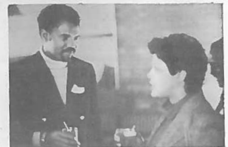
Plump and Palmer