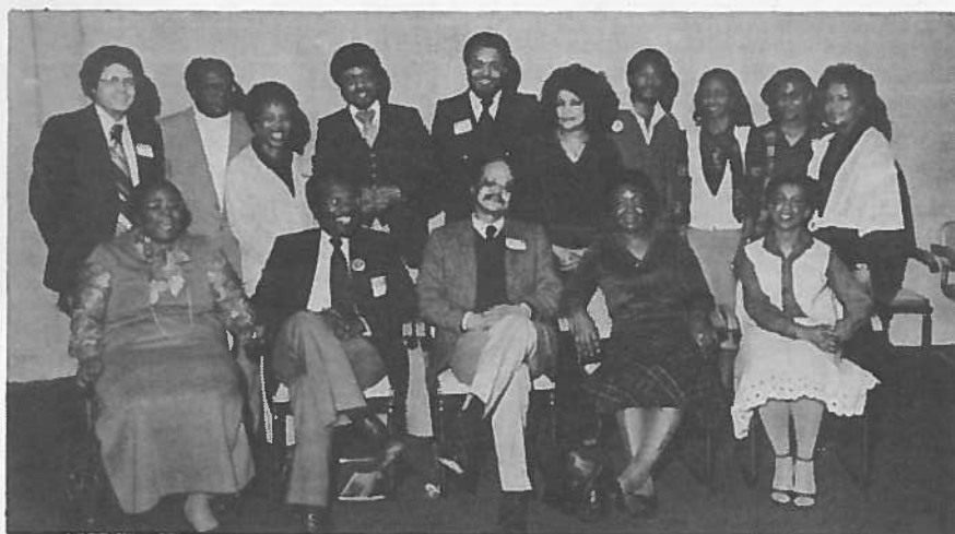
Participants in Recent I.C.B.S. Springfield Conference

I.C.B.S. warmly greets the Fifth Annual Conference of THE NATIONAL COUNCIL FOR BLACK STUDIES meeting in New York City, April 1-5, 1981. Keep up the fight and join us for the 1982 Sixth N.C.B.S. Conference in CHICAGO/ILLINOIS!